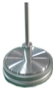
Abrasion head for pilling test